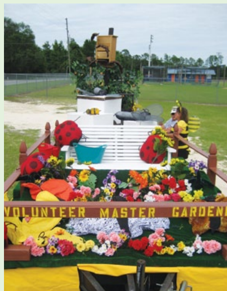
Float built by Master Gardener volunteers for 4th of July parade.