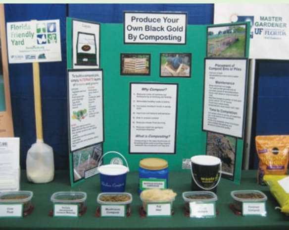
Composting display developed by Master Gardener volunteers.

a valuable asset to extending the Suwannee River Partnership's mission to provide research-based solutions that protect and conserve the water resources within the Suwannee River Water Management District by emphasizing the implementation of voluntary or incentive-based programs.