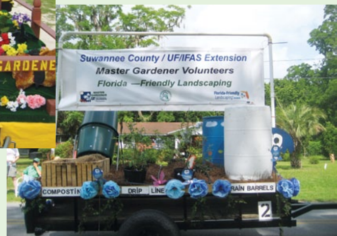
Float for Blueberry festival in Wellborn, FL.